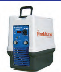
Workhorse 300ST Auto Start TIG