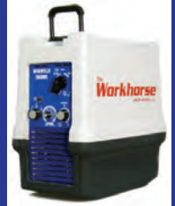
Workhorse 300MS MIGweld