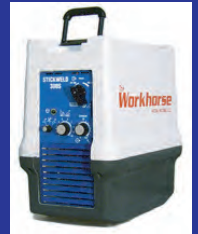
Workhorse 300S Stick/Lift start TIG