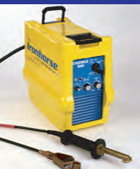
Ironhorse 300S 700v DC Input