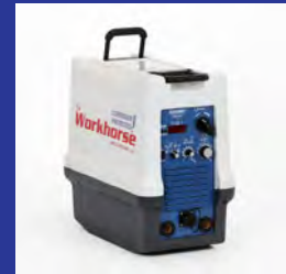
Workhorse 300SMT Multi-Process CC/CV, New front panel cable connections