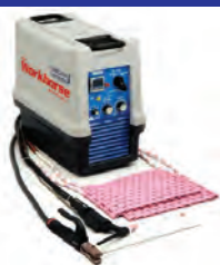
Workhorse 300SH Combined Preheater & Welder